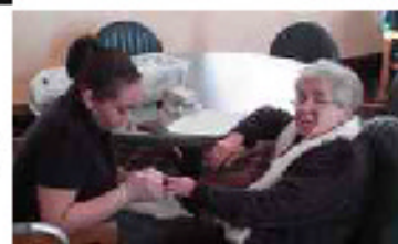
A little pampering!