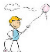
Feb. 8 National Kite Day