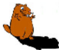
Feb. 2 Ground Hog Day