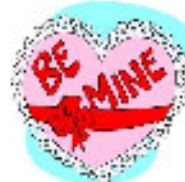
Feb. 14 Valentine's Day