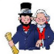
Feb. 20 Presidents Day