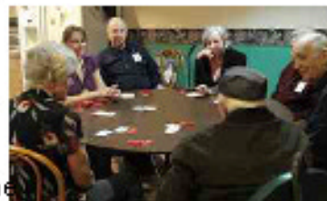
It's Poker Night!